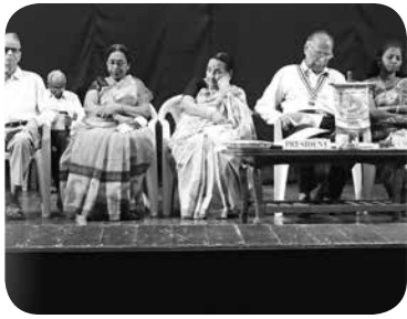
Dignitaries on the dais